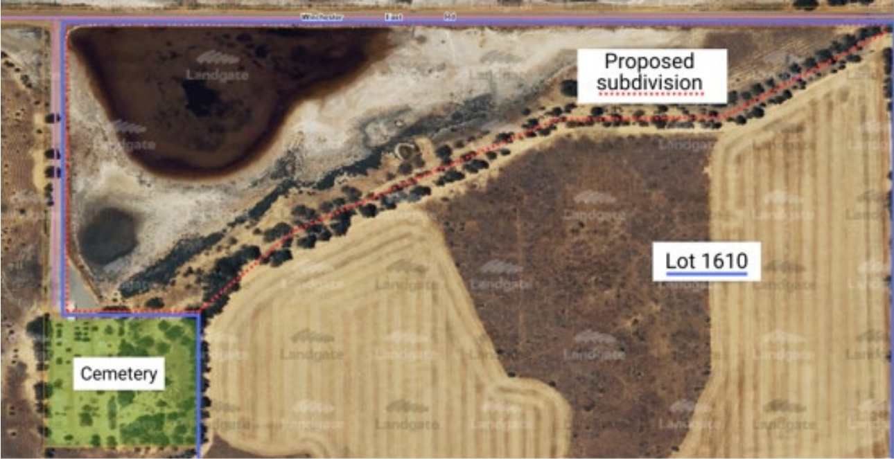
Landgate Map showing Lot 1610 Winchester East Road proposed subdivision

The portion of land that the Shire would acquire includes the salt lagoon and the parking lot (see photos below).