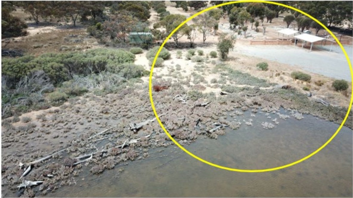
Winchester Public Cemetery – picture taken July 2023 showing water levels close to north section of graves and gazebo

The portion of land that the Shire would acquire includes the salt lagoon and the parking lot (see photos below).